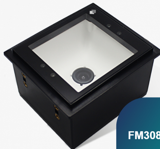
FM3080 Hind Stationary Scanners